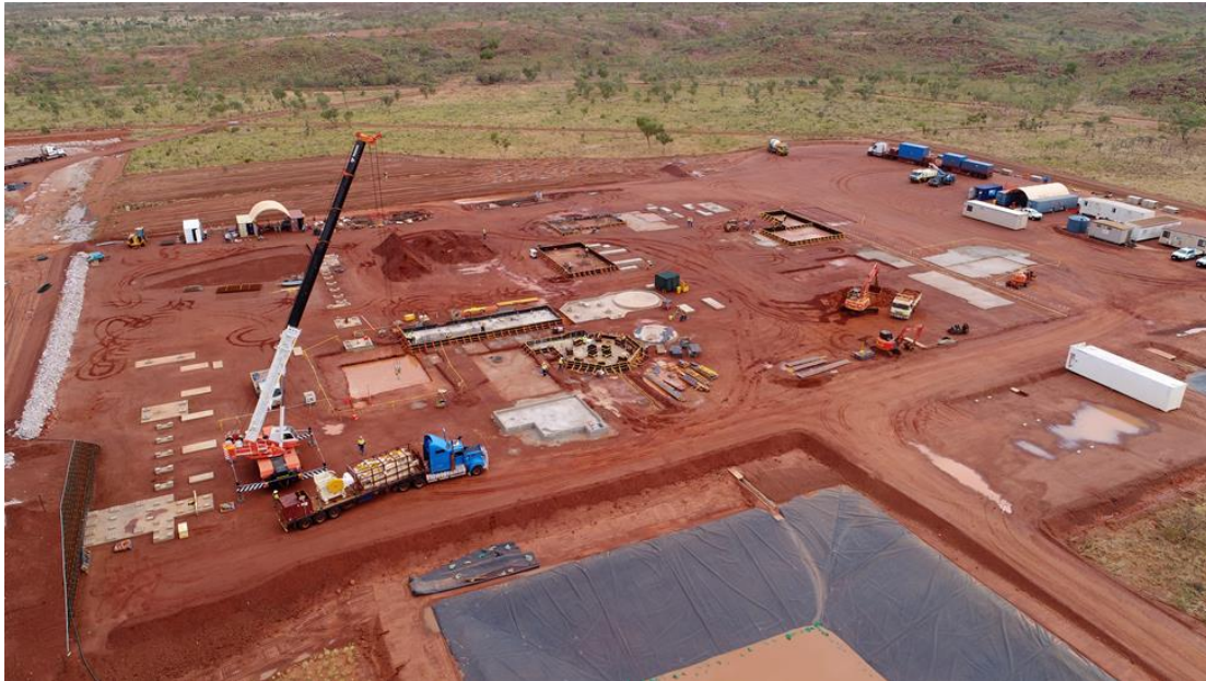
Concrete works advancing in Beneficiation and Hydromet areas

The majority of the first shipment of equipment and modular components from Sinosteel MECC was delivered to Browns Range over the last two weeks. This shipment is the first of three main shipments of process pilot plant modules and equipment, with the second shipment having departed Shanghai and due in Darwin in the coming weeks.