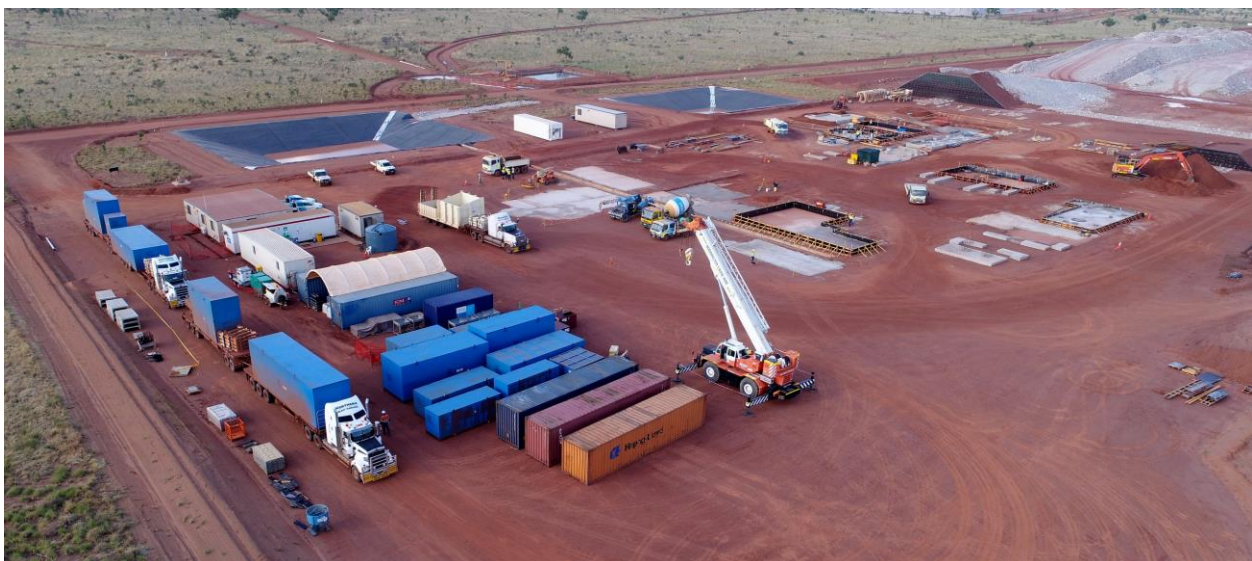
Aerial View of the Pilot Plant – Browns Range

THIS PHOTO IS TAKEN 7 MONTHS AFTER THE BOARD APPROVED THE PROJECT