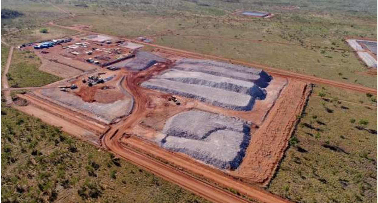
Aerial View of the Pilot Plant, ROM pad and ore stockpiles – Browns Range

Primero Group are well advanced with the concrete works in the Beneficiation plant area and are making good progress with concrete works in the Hydromet plant area.