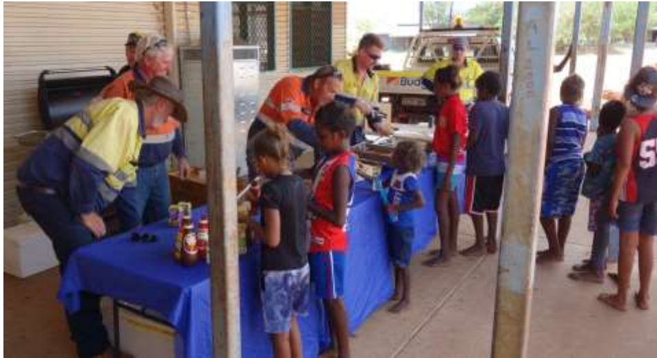
Annual Christmas BBQ at Ringer Soak

The Annual Christmas BBQ was held in Ringer Soak on the 1 st of December, to celebrate the end of the year with the local community. Northern Minerals provided a BBQ for all the people in Ringer Soak with some colouring books and sporting equipment provided to the children.