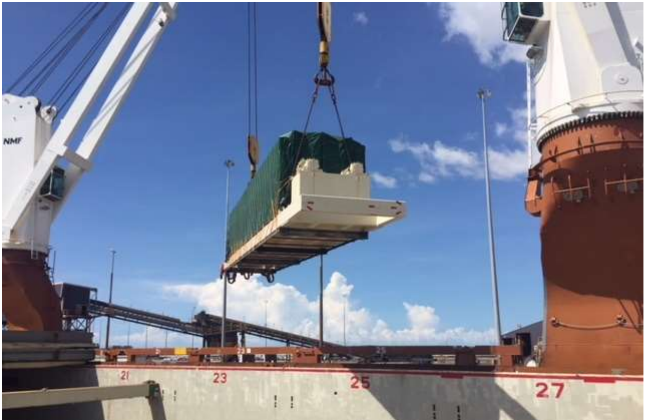
Second shipment being unloaded in Darwin – Kiln Base