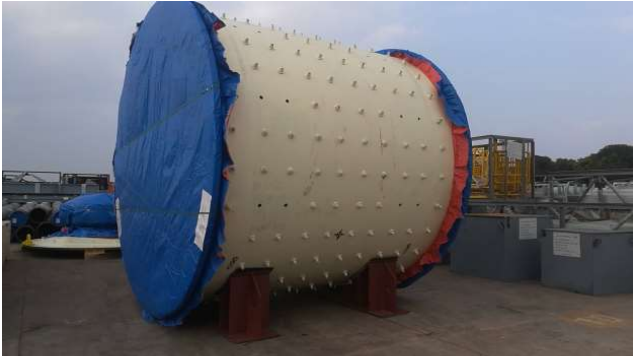
Third shipment being consolidated in Shanghai – Mill Shell