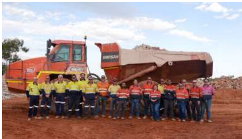
Photo taken after the ore truck exited the Gambit West pit for the final time

MACA Mining has completed mining at Browns Range on time, on budget and delivered extra tonnes to the Run of Mine (ROM) Pad. 205,000 1 tonnes were delivered to the ROM Pad against an original budget of 180,000 tonnes. Congratulations to the MACA Mining team and the NTU Mining Team in delivering a quality result with no injuries.