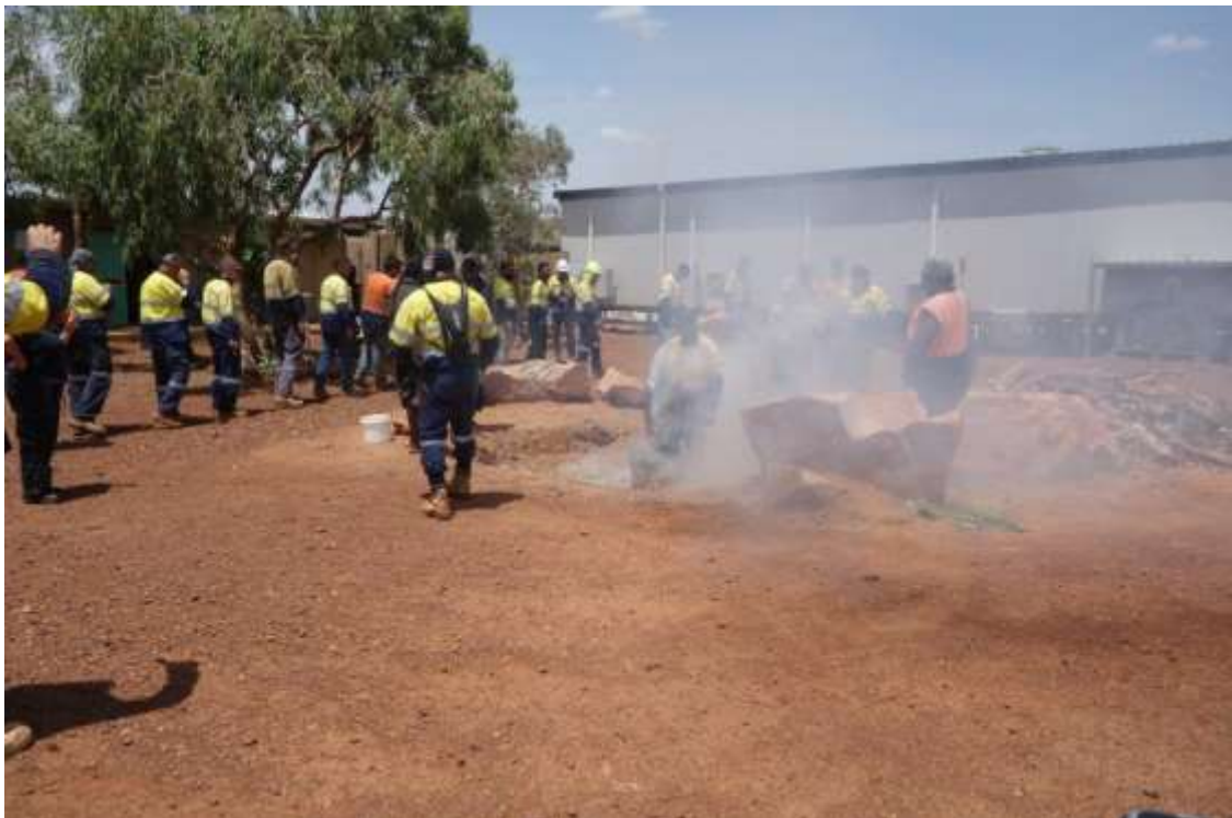
Smoking Ceremony at Browns Range

The Annual Christmas BBQ was held in Ringer Soak on the 1 st of December, to celebrate the end of the year with the local community. Northern Minerals provided a BBQ for all the people in Ringer Soak with some colouring books and sporting equipment provided to the children.